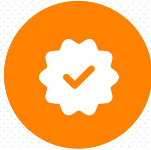
2 performance verifications