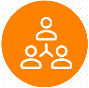
Access to A+ roofer referral list