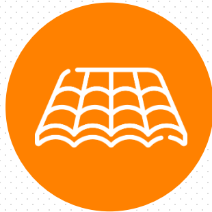
Discounted bird guard installation