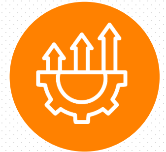
System upgrade options