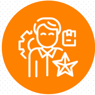
Assigned project coordination specialist