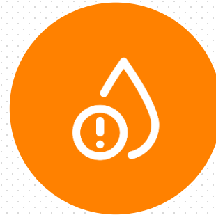
No leak roof respect guarantee