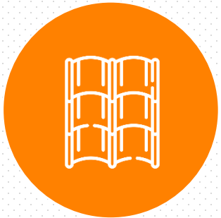
Bottom flashings with every tile mount