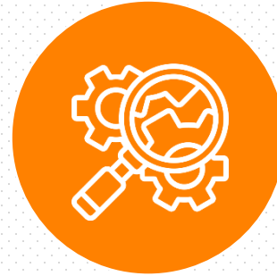
Detailed system inspection